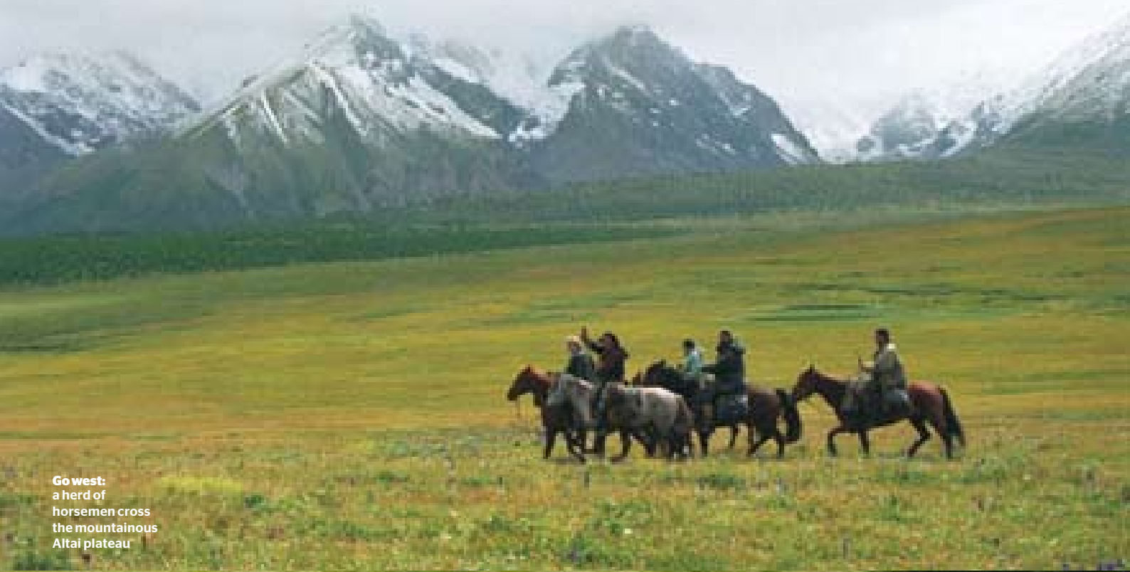
Go west: a herd of horsemen cross the mountainous Altai plateau